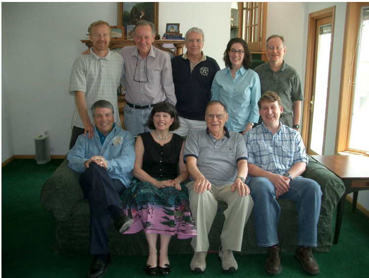
Figure 2. Participants in Social Interdependence Theory Conference, 2006, Silverwind Farm, Shakopee, Minnesota.