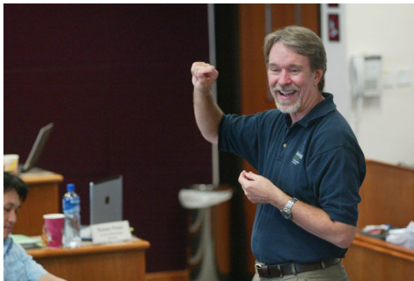
Figure 1. Keith Murnighan and his passion for teaching, 2013.

For people like me, attracted to the simple elegance of bargaining games and game theory, Keith's work shows us how the games can be used to understand broad social and organizational issues. For people interested in specific organizational and social issues, Keith's work points to the value of using games (and the associated rigorous theory) as the empirical context. His enthusiasm for teaching is reflected in Figure 1 below.